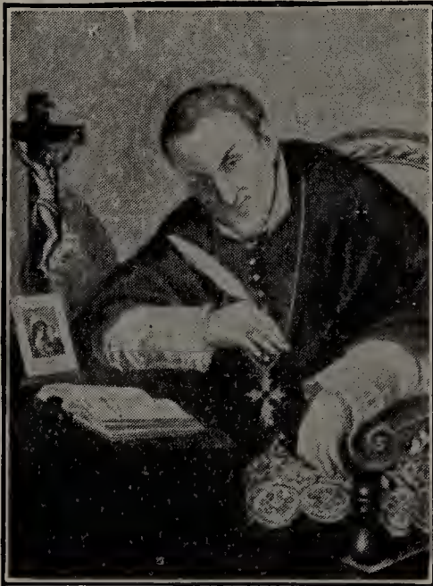
St. Alphonsus de Liguori, Bishop, Doctor of the Church, Founder of the Congregation of the Most Holy Redeemer.