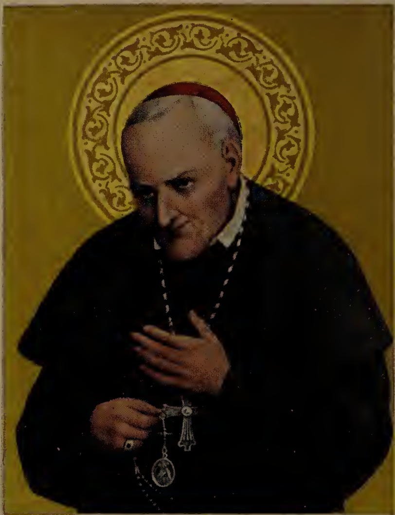
ST. ALPHONSUS MARIA DE LIGUORI